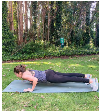
Push-up with static hold

For appointments and more information, call (844) 41-ORTHO (844-416-7846).